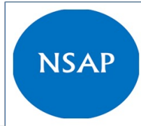
National Social Assistance Programme (NSAP)