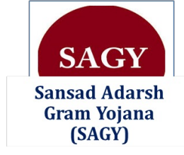
Sansad Adarsh Gram Yojana (SAGY)