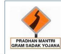
Pradhan Mantri Gram Sadak Yojana (PMGSY)