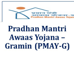
Pradhan Mantri Awaas Yojana - Gramin (PMAY-G)