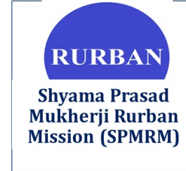
Shyama Prasad Mukherji Rurban Mission (SPMRM)