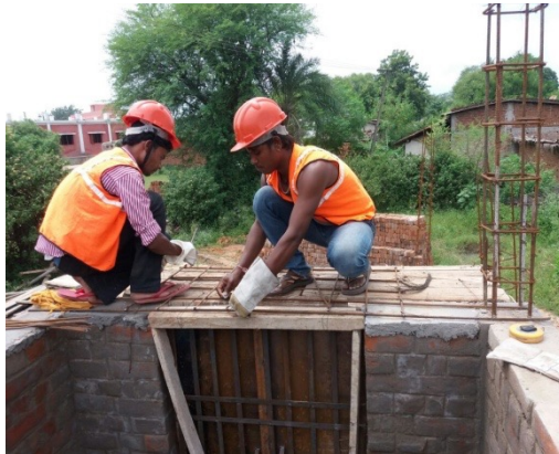
Placing of reinforcement steel