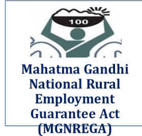
Mahatma Gandhi National Rural Employment Guarantee Act (MGNREGA)